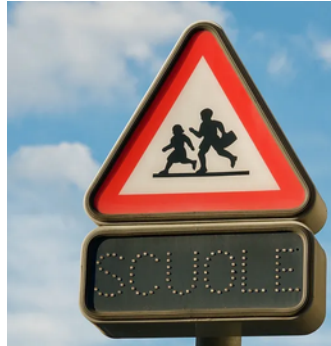
I Bike to School