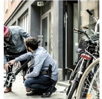
Make Your Bike More You!