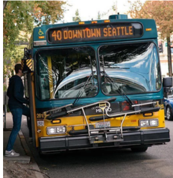
Why I Get Around By Bus