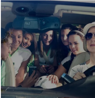
How I Carpool to School

Click on one of our Impact Projects below to get the template. Write up your project, find your stakeholders, follow the procedure, and do the math!